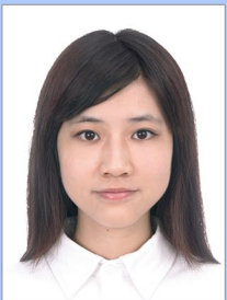
Clothes color identical to background