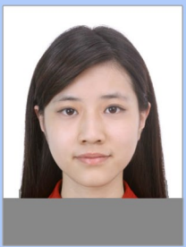
Damaged photo or other defects