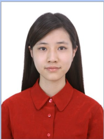
Head too small