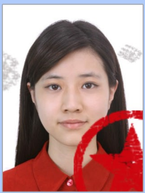
Stamp or other patterns on photo