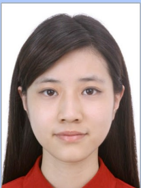
Head too big