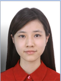
Shadows on background