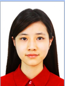
Contrast too high