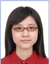
Frame too thick