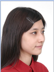
Not facing camera