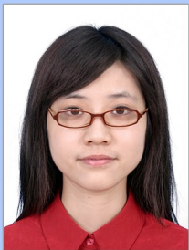
Frame covering eyes