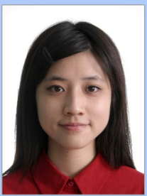
Shadows on face