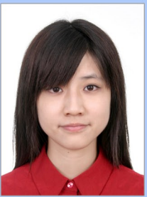
Hair covering eyes, eyebrows or ears