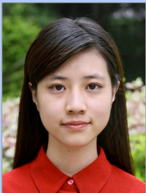
Background not plain